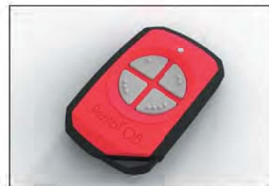
Case Black Upper Red

Choose from a range of colour options. Mix and match! If you require a custom Pantone® colour please contact us for more information