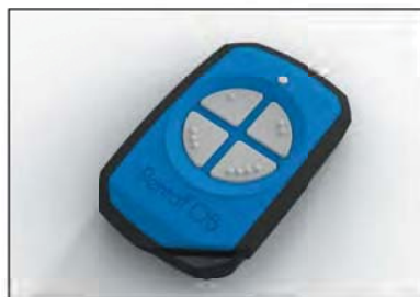
Case Black Upper Blue