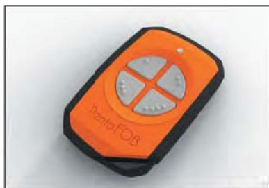
Case Black Upper Orange

The PentaFOB® is an extremely versatile remote control that can be customized through a range of configurations and colours to suit your needs.