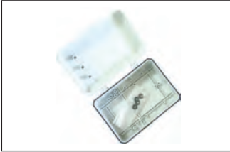
Weatherproof Case for receiver unit