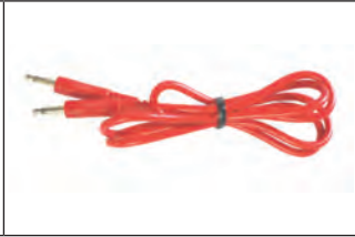
Gigalink™ Coding Cable For coding Gigalink transmitters to receivers