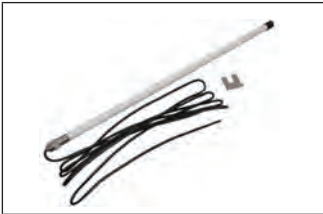
Suitable Antennas ANT433 series (433MHz Series) or ANT27 series (27MHz Series)