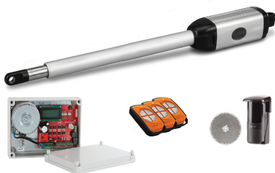
iS450 (Single Kit)