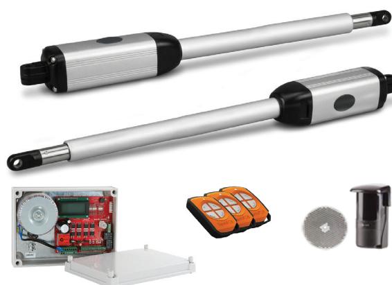
iS450D (Double Kit)